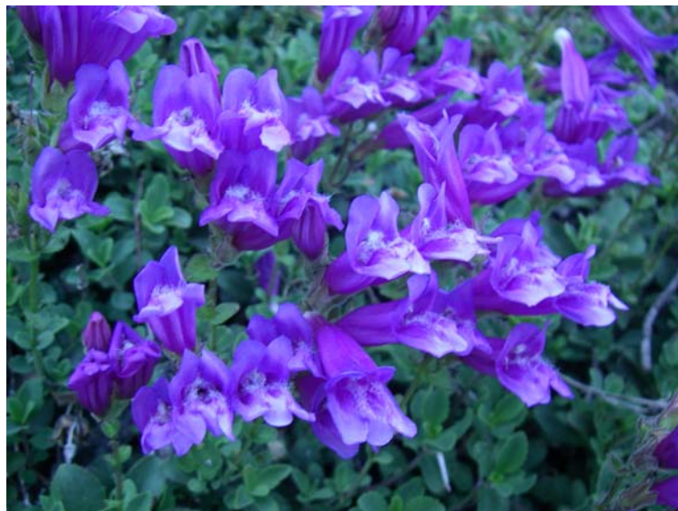
Penstemon davidsonii