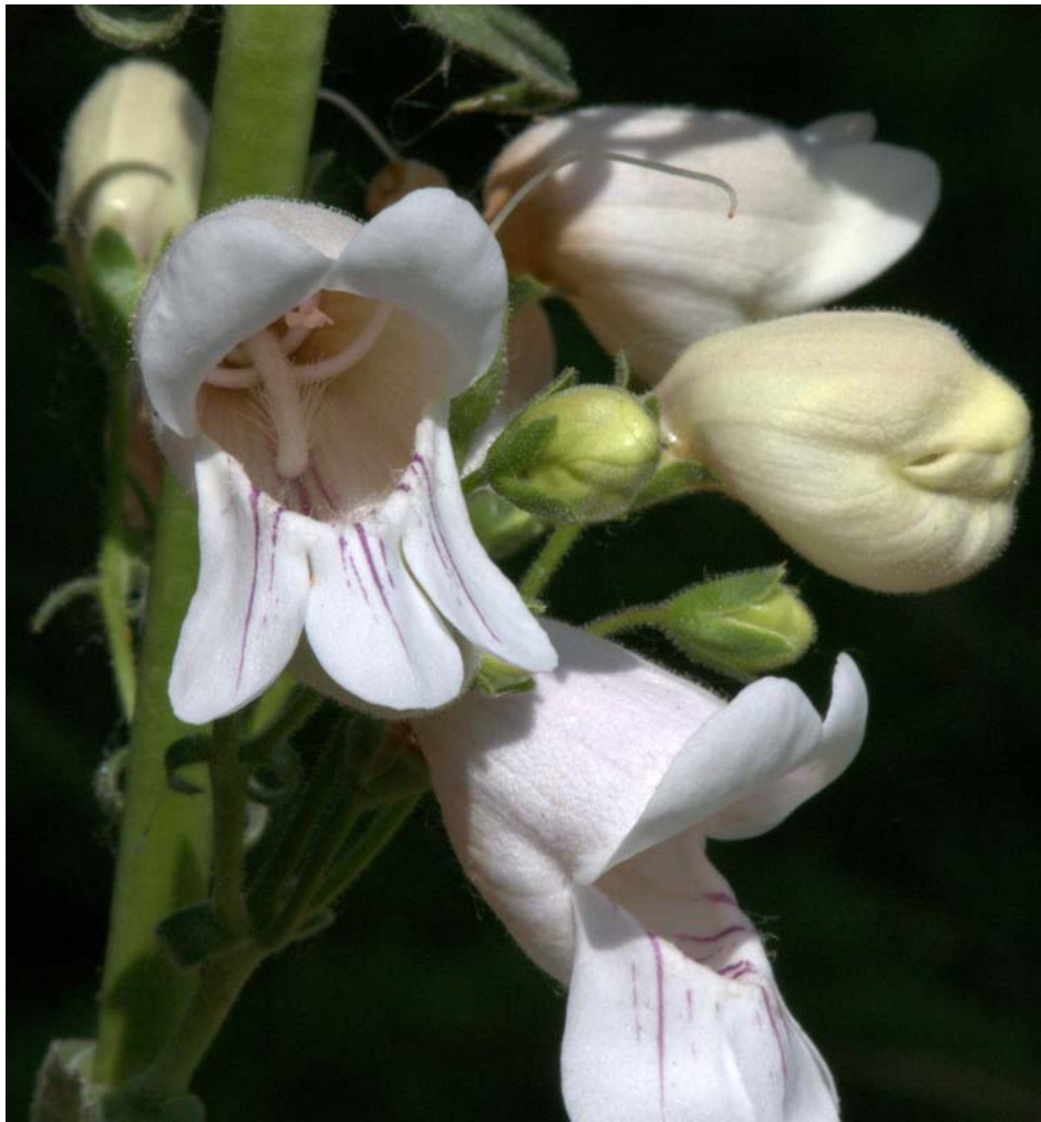
P. eximeus in Denver Garden in June 2010.

This is the tallest penstemon in the genera. It has some similar features as P. palmeri and is in the Section Peltranthera, subsection Peltanthera. The only photo I had seen up to this year was one of someone holding the main stem way over his head - making the plant about seven feet tall. P. eximeus is native to the dry sandy arroyos of Baja California and has not been in cultivation in the States for very long.