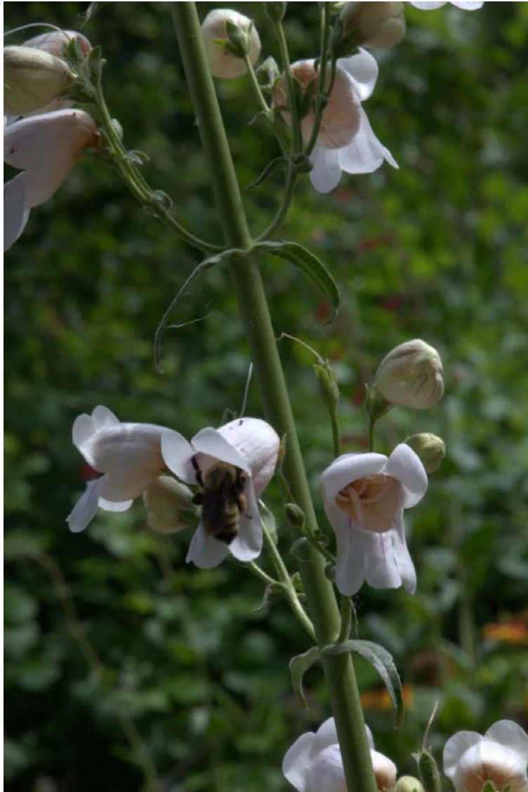
Bee pollinating P. eximeus in Denver garden.

Later in the summer one of the plants up and died but left a wealth of seed. The other plant continued to be vigorous and had a second smaller blooming in October before our first freeze.