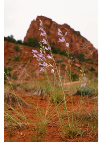
Penstemon comarrhenus mevens