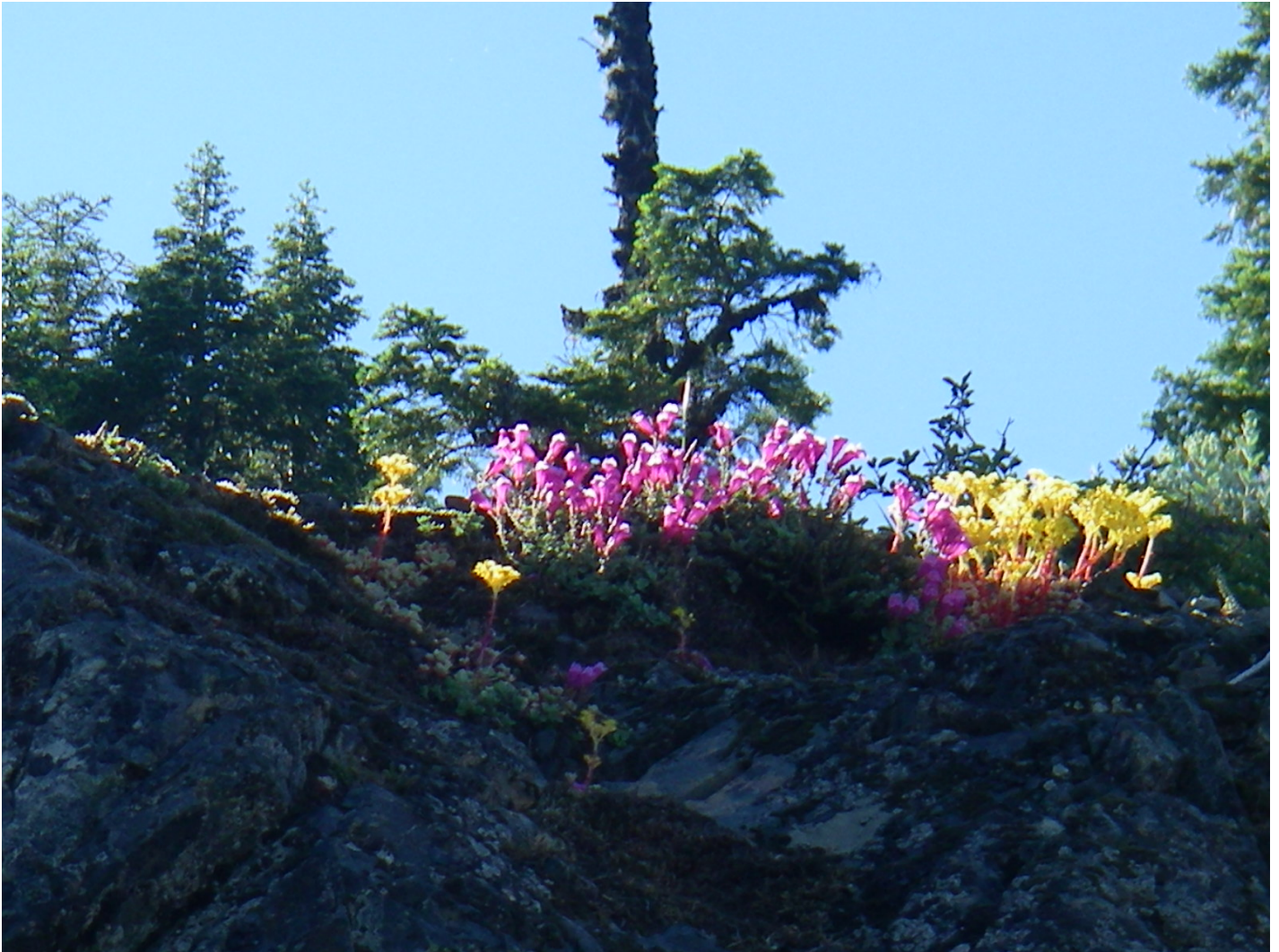
Penstemon rupicola